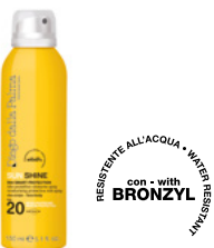
Moisturizing protective milk spray SPF20 FACE/BODY 150ml cylinder