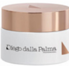
24-hour revitalising anti-age cream ▲▲▲▲▲ normal skin 50ml jar