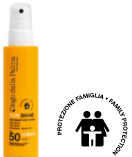
Milk spray SPF50 FACE/BODY 150ml spray bottle