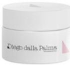
ultra gentle 24-hour nutricream 50ml jar