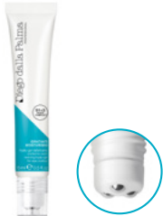
Reviving hyalu-gel for eye contour 15 ml roll-on tube