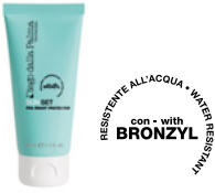
Soothing after sun cream FACE 50ml tube