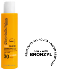
Moisturizing protective milk SPF30 BODY 150ml bottle

SUN SHINE Protects and illuminates the color.