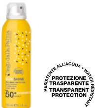
Invisible spray SPF50+ Transparent protection BODY 150ml cylinder