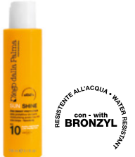
Moisturizing protective milk SPF10 BODY 150ml bottle