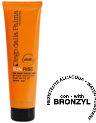
Super tanning gel LEGS 150ml tube

SUN RISE Prepares the skin to sun exposure.