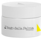
Cica-ceramides cream 50ml jar

Innovative key to professional success, calibrated and precise. It allows to achieve highly-visible and certified results in dermo-regeneration, avoiding any unpleasant side effect and strong inflammatory reactions.