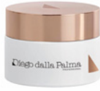
24-hour skin renewal anti-age cream ▲▲▲▲▲ very dry skin 50ml jar