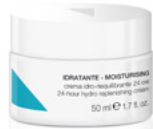
24-Hour hydro replenishing cream 50ml jar

The deep cleansing treatment that promotes detoxification and cellular vitality. Enriched with CELL DETOXIUM.