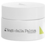
24-hour matifying anti-age cream 50ml jar