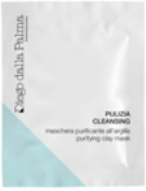
Purifying clay mask 10 single-use sachets