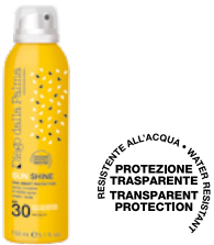
Invisible spray SPF30 Transparent protection BODY 150ml cylinder