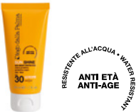
Protective cream SPF30 VISO 50ml tube