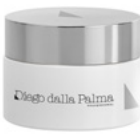
24-hour even white cream 50ml jar