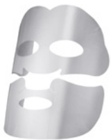
SUPERMASK™ Plumping lifting mask single use mask