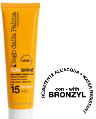
Protective cream SPF15 FACE/BODY 150ml tube