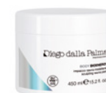
Sculpting sauna pack 450ml jar