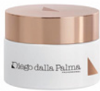
24-hour redensifying anti-age cream ▲▲▲▲▲ dry skin 50ml jar