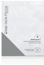
Intensive white mask single use mask

The solution to give brightness to the face and counteract dark spots. Reinforced with pro white b-spheres.