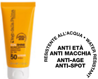
Protective cream SPF50 VISO 50ml tube