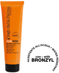
Ultra rapid tan preparer gel FACE/BODY 150ml tube