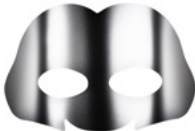
SUPERMASK™ Soothing relax mask for eyes and critical points single use hydrogel mask