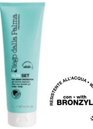
After sun shower gel BODY 250ml tube