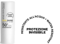
Sun stick SPF50+ Tattoos and sensitive areas FACE/BODY 10ml stick

SUN RISE Prepares the skin to sun exposure.