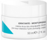
24-Hour intensive hydro plumping cream 50ml jar