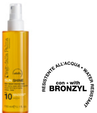
Super tanning oil SPF10 BODY 150ml spray bottle

SUNSET & SENSUAL SUN Prolongs the tan and illuminates the skin.