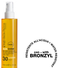
Super tanning oil SPF 30 BODY 150ml spray bottle

SUN SHINE Protects and illuminates the color.