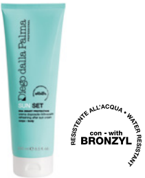
After sun shower gel BODY 250ml tube

SUNSET & SENSUAL SUN Prolongs the tan and illuminates the skin.