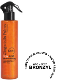
Super tanning water BODY 300ml spray bottle